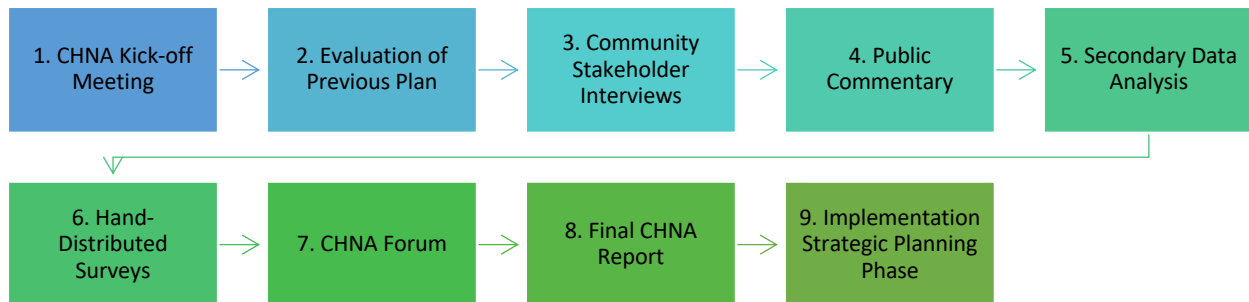
Chart 1: CHNA Process

Based on data collection findings and prioritization of community health needs the final CHNA report was developed. 2 Terrebonne General Medical Center will use the CHNA findings to develop goals and strategies to address local health care concerns and will work with regional and local community partnerships to improve the overall status of their community. This report fulfills TGMC’s IRS requirements for tax-exempt hospitals and health systems to conduct a CHNA and implementation strategy plan.